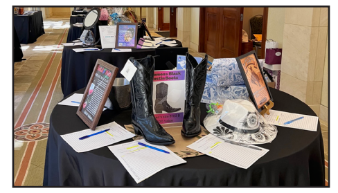
The WRJ Annual Brunch and Auction had something for everyone.

Not sure if you're a member? Reach out to me.