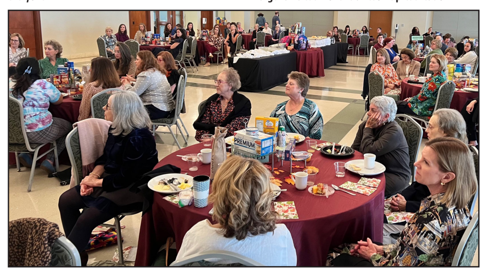
The Annual Brunch helped raise funds for Beth-El's Religious School and Jewish Camperships.