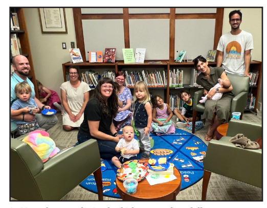
Jr. Maccabees in the Beth-El Library at their fall event.