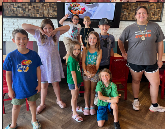
Maccabees (1st-4th grades) toured the Bureau of Engraving and had dinner at Luna Grill on June 27.