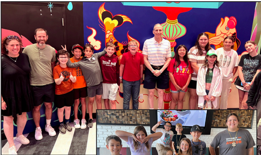
BEJY (5th-7th grades) at Meow Wolf on June 1.